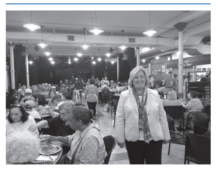
Visiting the Carter Burden Center for the Aging: Seawright has allocated $150,000 to the center for renovation of their Luncheon Program