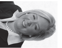
Assembly Member Rebecca A. Seawright

Calling all students on the Upper East Side and Roosevelt Island!