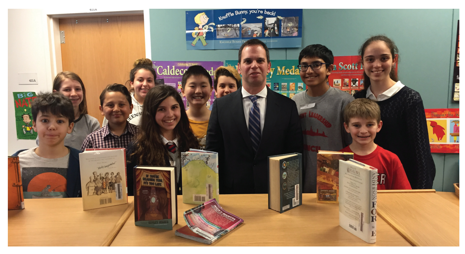
I loved meeting with these future leaders who are part of the Manhattan Leadership Council.