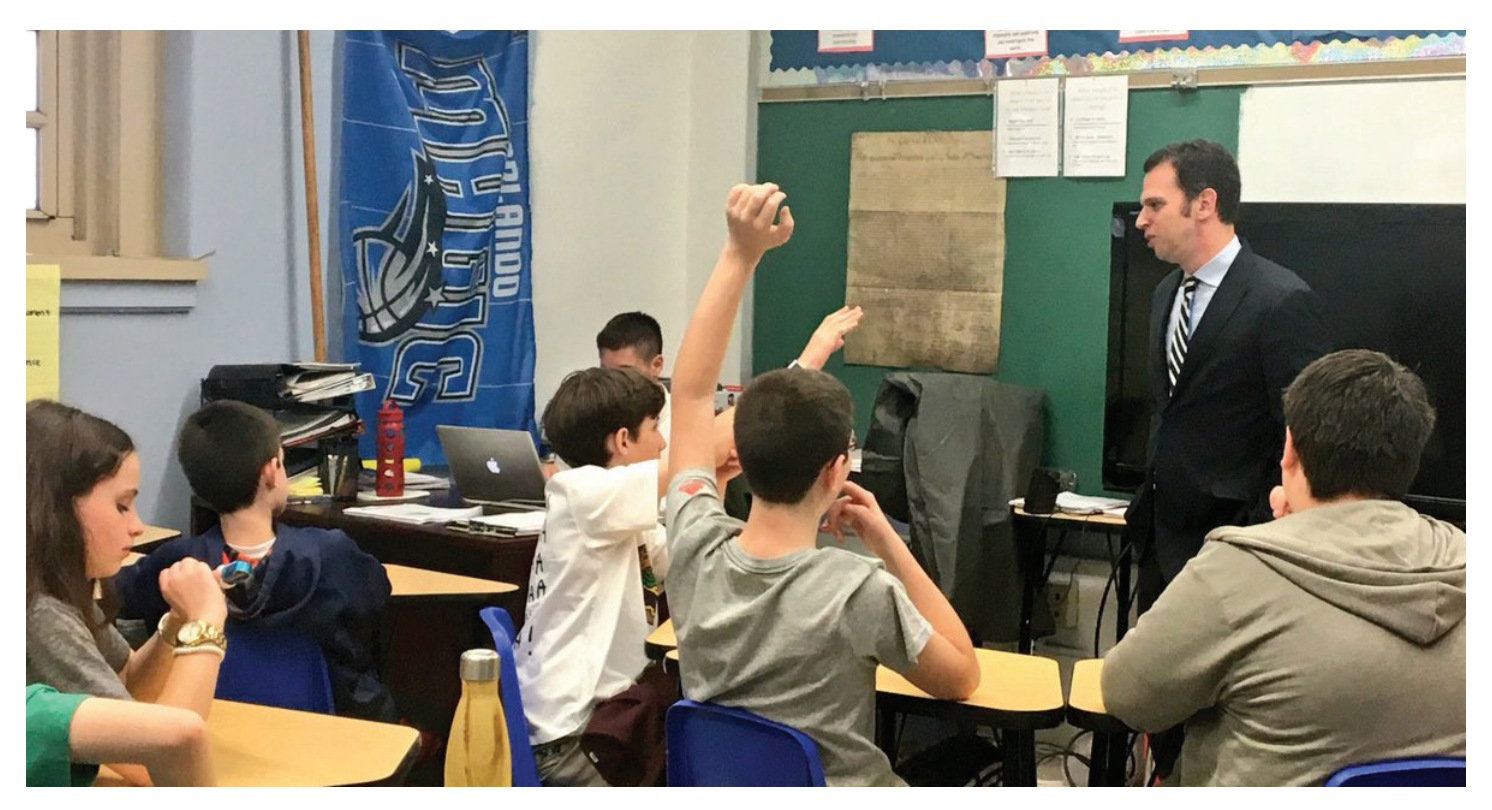
Taking questions from students interested in public service at Yorkville Middle School's Career Day.

If you would like more information, please visit the Assembly's website.