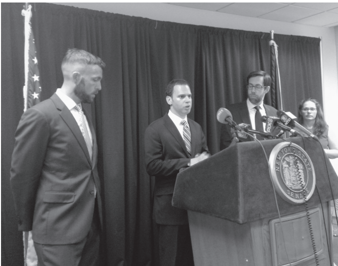
Assemblymember Quart and Senator Squadron.

just bicyclists. Additionally, bike lanes help to reduce biking on the sidewalks—again, protecting pedestrians along with bicyclists. While the city is improving access to bike lanes on avenues, crosstown bike lanes are an area where further growth is necessary and possible. Near the end of 2015, Community Board 8 called for protected bike lanes on the Upper East Side—a move that will improve the commutes of all who live in the neighborhood: bicyclists, pedestrians, and drivers alike. I look forward to spending 2016 making the city streets and safer for everyone who uses them—whether on foot, by car, or via bicycle.