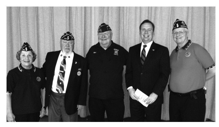
Participating in a Flag Day Ceremony at P.S. 30 with members of the Veterans of Foreign Wars.