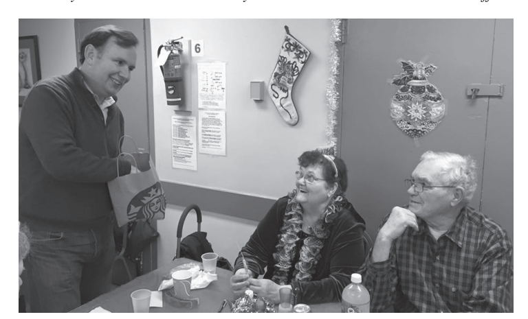
Meeting with seniors at the Todt Hill Friendship Club.