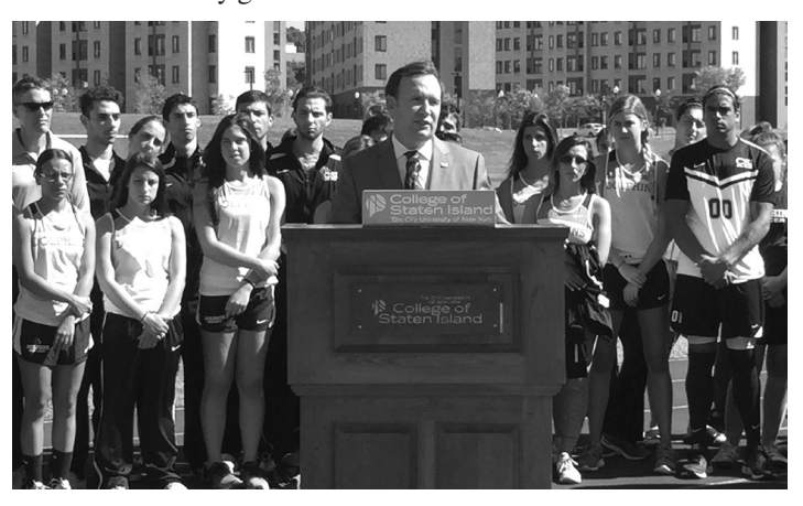
Addressing students and faculty of the College of Staten Island.

The Aid for Part-Time Study (APTS) program provides grant assistance for eligible part-time students enrolled in approved undergraduate studies. Awards provide up to $2,000 per year for part-time undergraduate study at participating institutions in New York State. Visit www.hesc.ny.gov for more information.