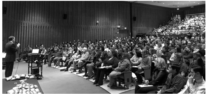
Assemblyman Cusick addresses a full auditorium at Wagner High School at an Opioid Overdose Prevention Event.

Through a partnership with Governor Cuomo, the State Department of Transportation, and Councilman Steven Matteo, we secured state funding to expedite the construction of the widening of the Slosson Avenue exit off the westbound Staten Island Expressway. The project, now complete, widened the lower half of the ramp from one lane to two, allowing for much smoother traffic flow through the intersection and limiting backup which often times spilled back onto the Expressway. Commuters who use the ramp during rush hour, and parents who drop off and pick up their children at St. Teresa's School and PS 29 are among the 5,600 daily motorists who will see marked improvements in their travel through this chronically plagued intersection.