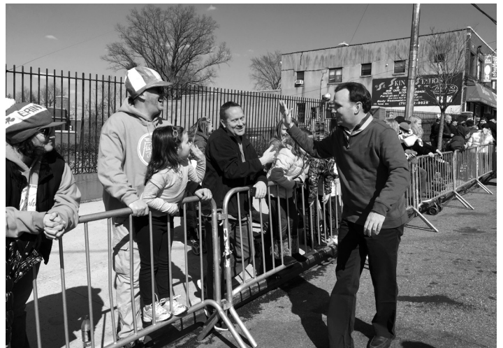
Assemblyman Cusick marches in the Staten Island St. Patrick's Day Parade.