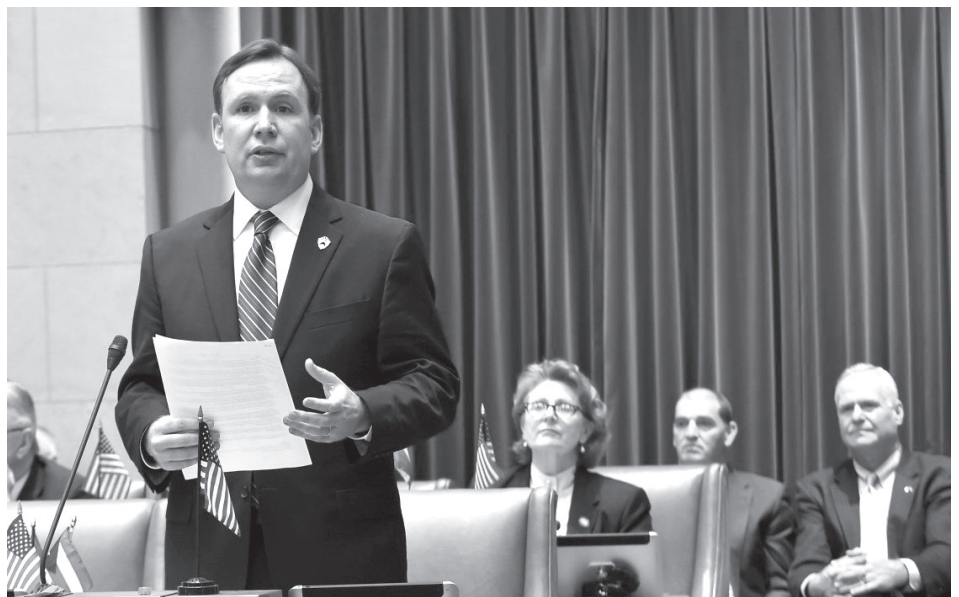
Assemblyman Cusick debates on the floor of the Assembly.

In this year's budget agreement, we included the largest income tax cut for middle class families in over 70 years. Over the next two years, the rate of 6.85 percent for taxpayers earning between $40,000 and $150,000 will be reduced to 6.45 percent, while those earning between $150,000 and $300,000 will see their rates drop from 6.85 percent to 6.65 percent. When these cuts are fully implemented in 2018, all taxpayers will pay a rate of 5.5 percent. These new rates will save New Yorkers over $6 billion in the first four years, and will benefit over 6 million taxpayers.