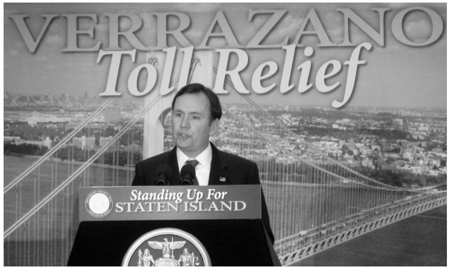
Assemblyman Cusick announces the toll discount plan for the Verrazano-Narrows Bridge.

In this year's budget, I fought to ensure the continuance of the long-awaited toll relief on the Verrazano Bridge for Staten Island residents and commercial drivers with New York State E-ZPass tags. The final 2016-2017 budget agreement includes $10.3 million for this discount. The Staten Island resident rate is $5.50 per crossing with E-ZPass and the commercial discount will remain intact. Senator Lanza and I negotiated the deal with the Governor's Office and respective leaders in each house ensuring the discount remains for the coming year.