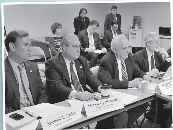
Assemblyman Cusick sits on the panel of the New York State Assembly roundtable discussions to address the sharp increase in illicit opiate and heroin use.