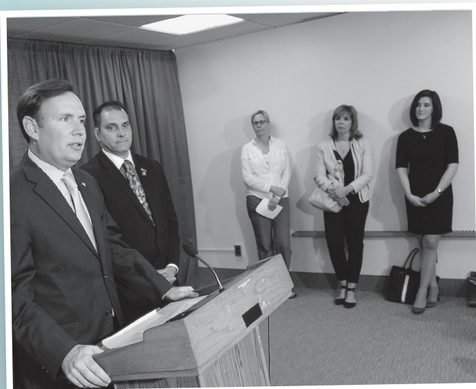
Assemblyman Cusick speaks at a press conference on his legislation (A.7003-A), which would ensure that those suffering from drug or alcohol addiction have access to treatment that is covered by their insurer.

mendation. Following the enactment of a law Assemblyman Cusick authored in 2012 known as I-STOP (Chapter 447 of the laws of 2012) to curb the abuse of prescription controlled substances, Cusick introduced the new legislation so that individuals with drug or alcohol addiction are able to access appropriate services from their insurer.