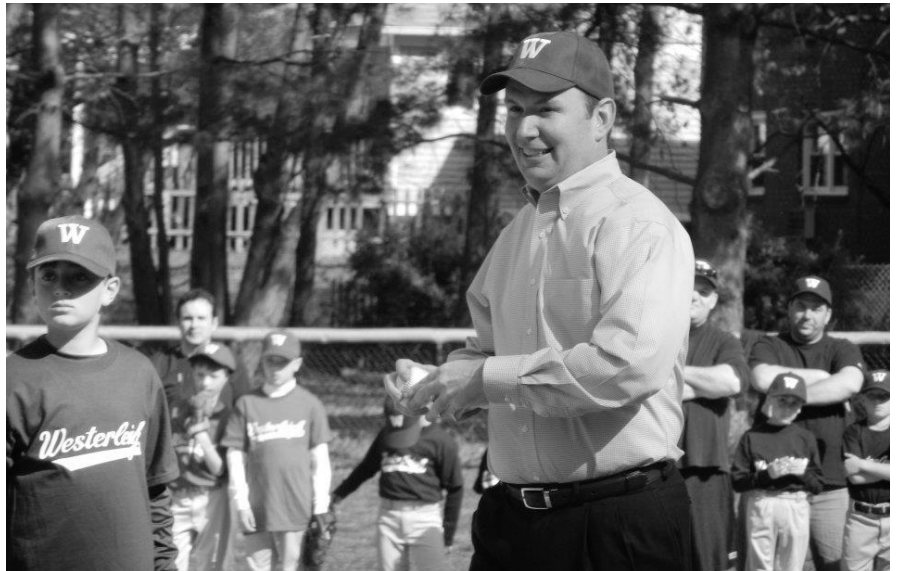
Assemblyman Cusick throws out the first pitch at Westerleigh Little League, the league he played in as a youngster.