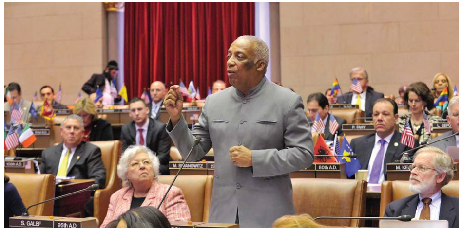
Assembly Member denounces the State Budget and demands an equitable and fair alternative.