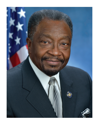
Sponsored by Assemblyman