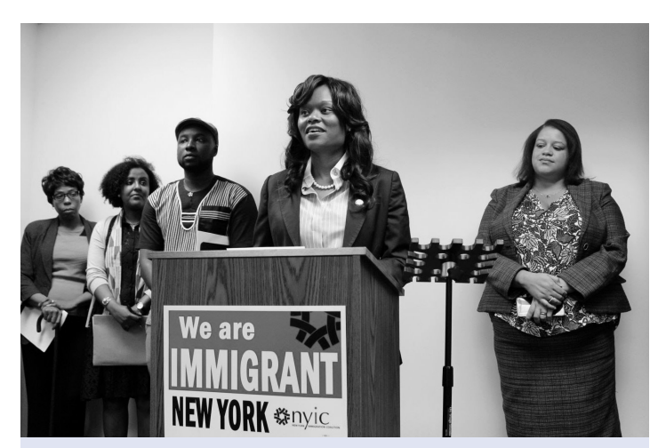
Assemblymember Bichotte (at the podium) and Assemblymember Solages (to her right), at the launch of the Black Immigration Empowerment Initiative, which seeks to make visible the issues, and provide resources for immigrants throughout the African diaspora.