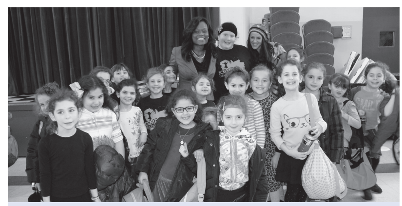
Assemblymember Bichotte visits with the young women of the Jewish Community Council Marine Park (JCCMP).