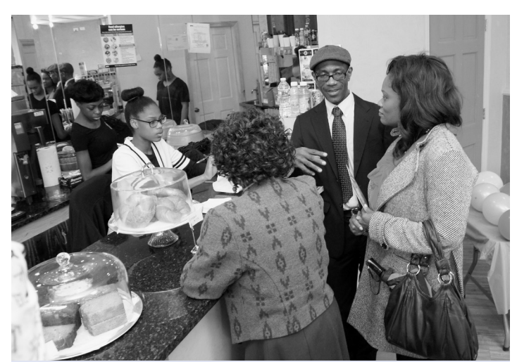
Assemblymember Bichotte attends the grand opening of Jahbrew, an artisanal coffee bar, in the heart of Flatbush.