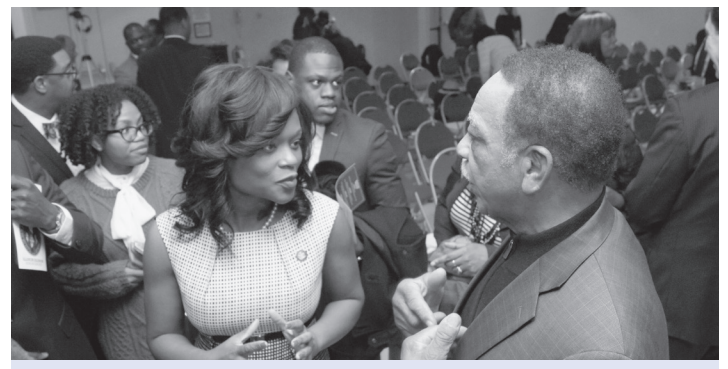
Assemblymember Bichotte responding to questions from constituents after her State of the District Address.