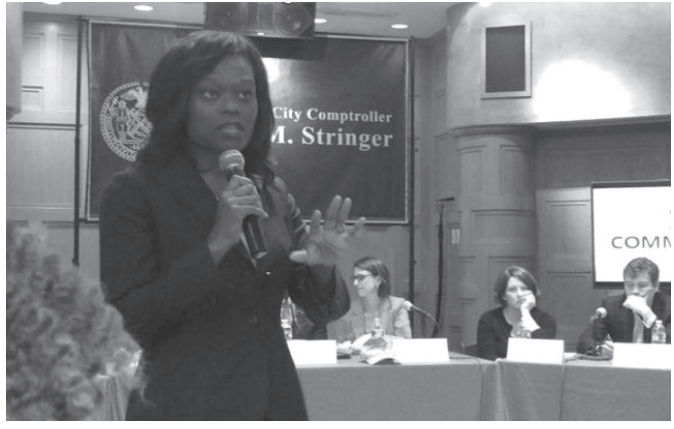
Assemblymember Bichotte responds to attendees about what role she can play to remove obstacles to working with government at the Red Tape Commission sponsored by NYC Comptroller Scott Stringer.