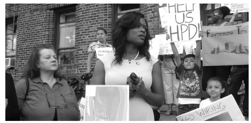
Assemblymember Bichotte speaking at a press conference in partnership with the Flatbush Tenant Coalition about the deplorable conditions that members of our community are living under.