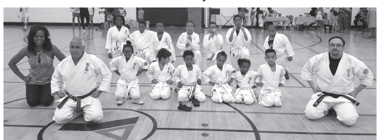
Assemblymember Bichotte, a former practitioner of martial arts herself, with aspiring martial artists at the Flatbush Y Back-to-School Barbecue.

Assemblymember Bichotte co-hosted back to school events with both the Flatbush Y and Jewish Community Council of Marine Park.