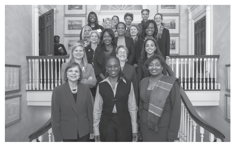
Assemblymember Bichotte along with other members of the NYS Legislative Women's Caucus attend a Meet and Greet hosted by First Lady Chirlane McCray.