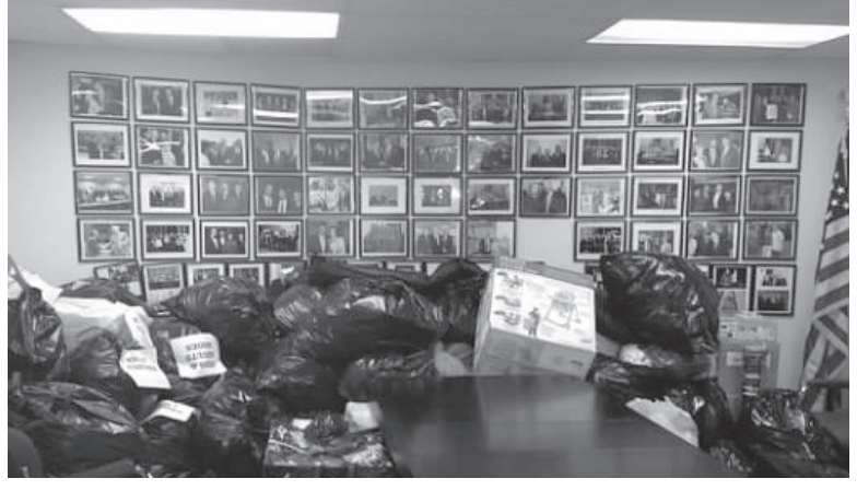
The donations for those affected by Hurricane Sandy nearly filled up our conference room in the days following the storm.

In the aftermath of Hurricane Sandy, Assemblyman Weprin and his staff coordinated a collection of items for those who lost nearly everything in the storm. We collected clothing, diapers, baby formula, toys, towels, flashlights, etc. We were overwhelmed by all the donations and thank everyone who participated. After the storm, our office coordinated with local agencies on incidents of power outages, flooding, and fallen trees on behalf of constituents. If your property suffered damage during the storm, or if you are still dealing with any other storm-related issue, please contact our office at weprind@assembly.state.ny.us to follow up.