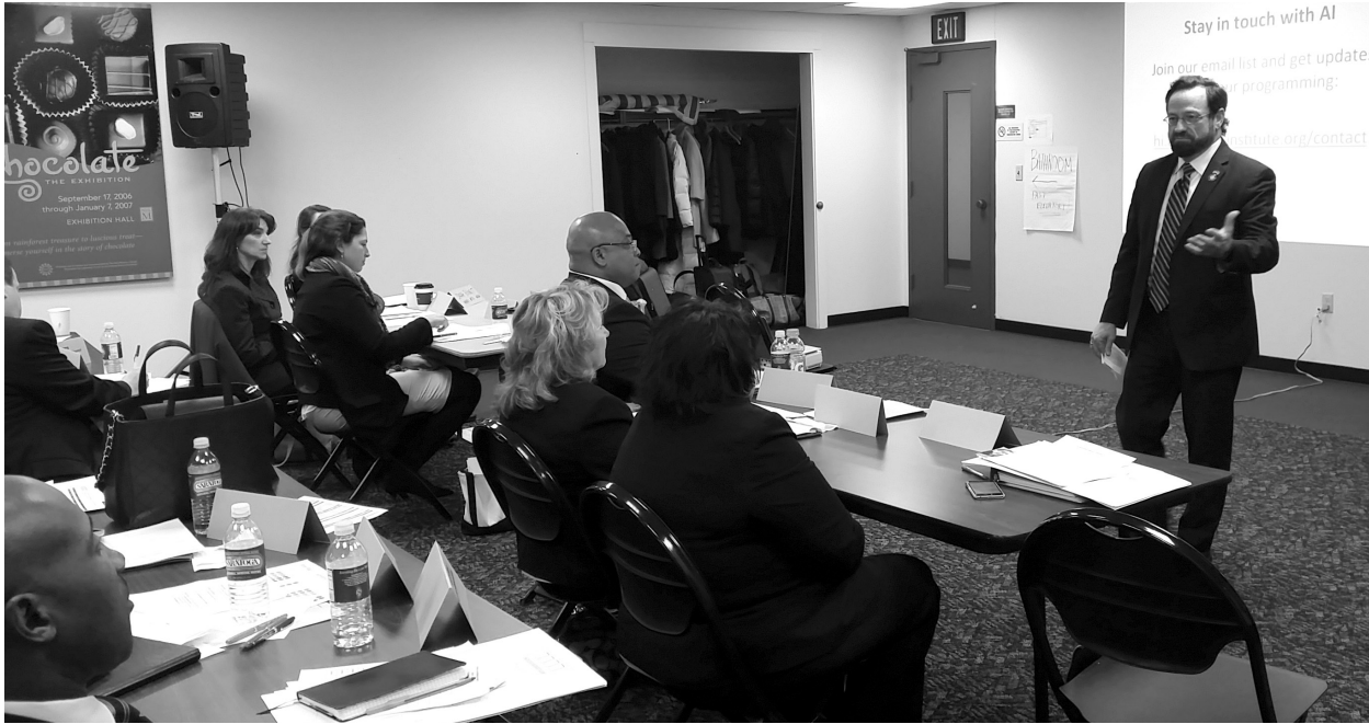
Speaking to NYATEP's NYC and Upstate Policy and Advocacy Workforce Academy in Albany, March 1, 2016