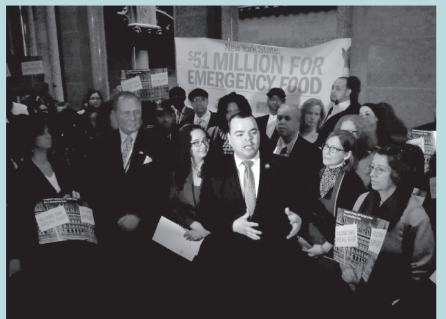
Assemblyman Crespo joins advocates from throughout the state to call for additional funding for emergency food programs.